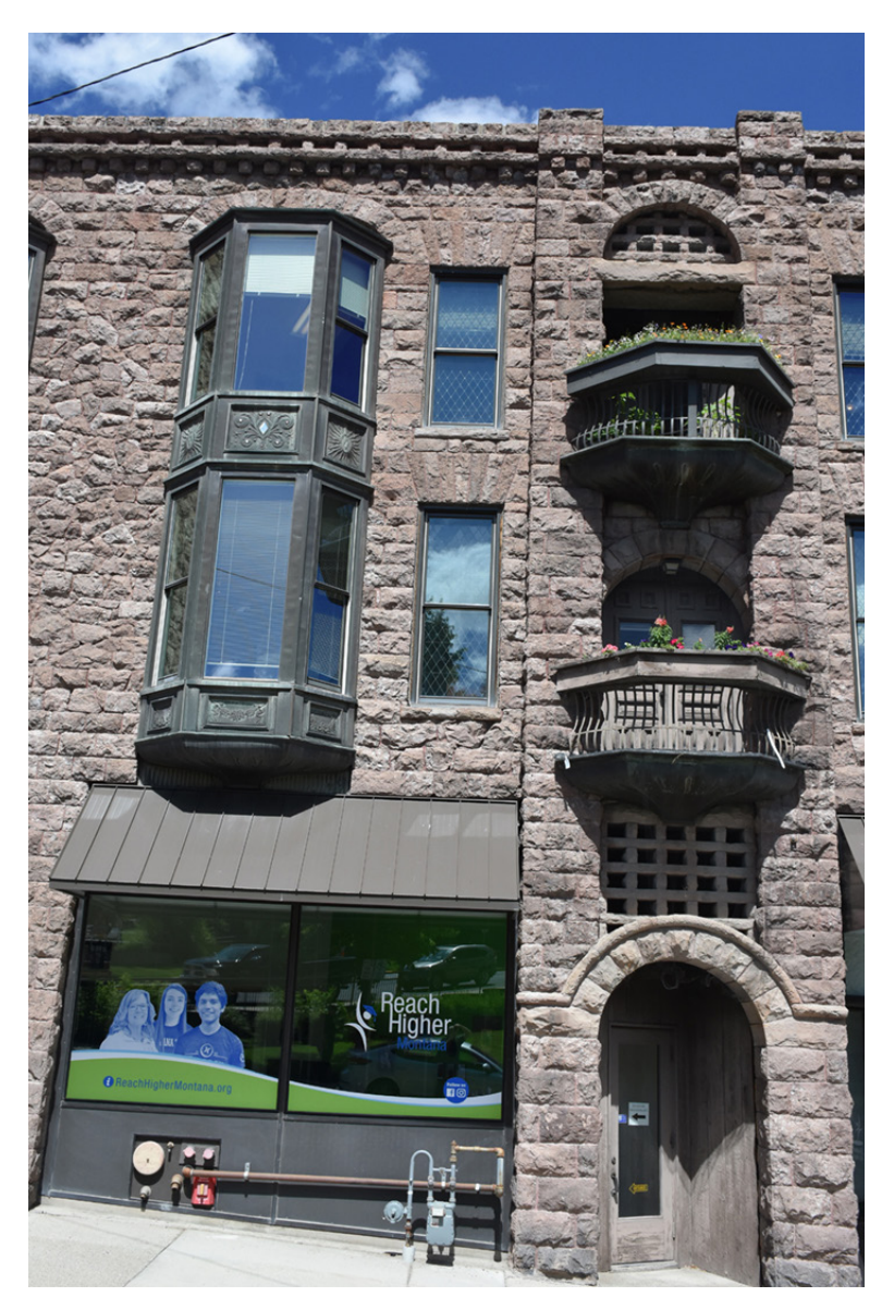
Figure 4.03 – Downtown and elsewhere, mixed-use buildings are seen as an effective strategy for Helena's housing objectives.

Standards for some infrastructure, such as streets, curbs, parking, and sidewalks may at times exceed immediate, localized requirements, but provide great savings over the long-term, particularly when such areas are annexed or require integration with system infrastructure. Balancing short and long-term needs — and ascribing costs to implement such decisions — will remain a struggle, especially for Helena.