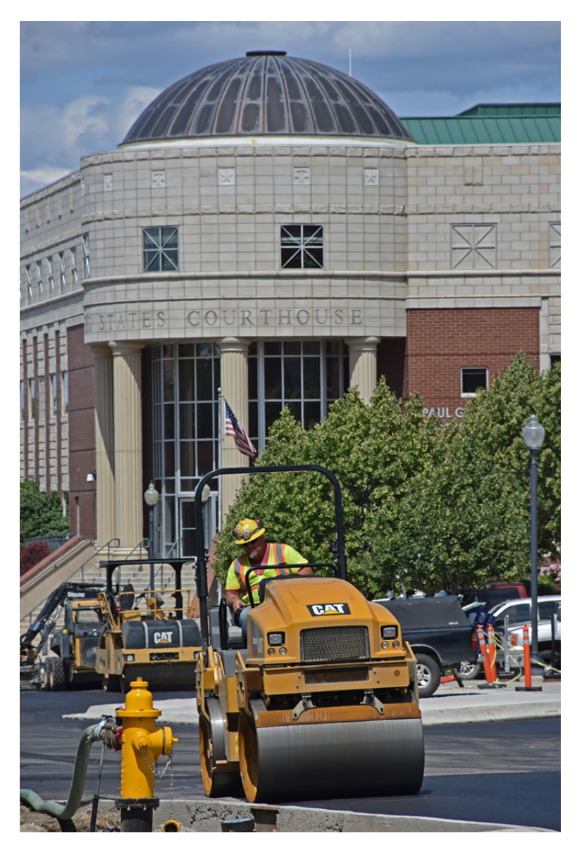
Figure 2.02 – Growth Policy objectives seek to diversify the local economy, building on government-sector jobs as an important foundation.