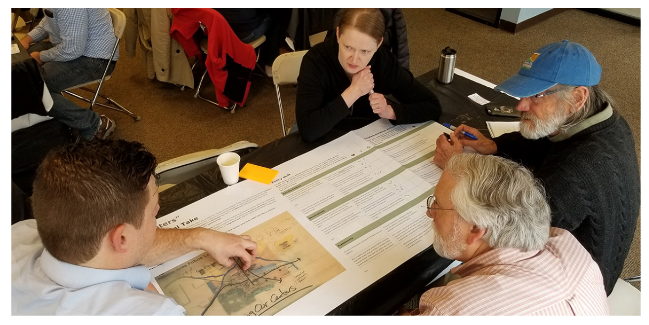
Figure 1.01 – The update process reviewed and updated the 2011 Growth Policy's objectives framework, explored by chapter topic. New strategies to shape the character of developing areas were also included.

have immediate effect on land use. The growth policy anticipates future changes of some existing land uses, presenting a generalized picture of an area's dominant land use character and trends and can reflect the transition of an existing land use to a new one. The growth policy attempts to show how current trends and logical progressions in land uses can be managed over a relatively long time frame.